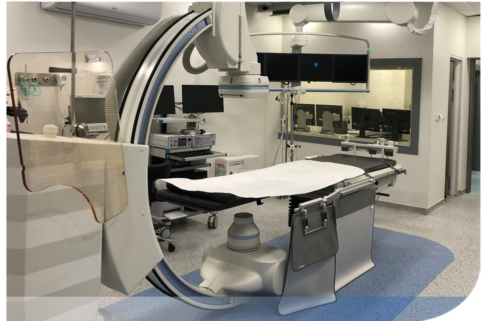
CathLab | Angiography ◀